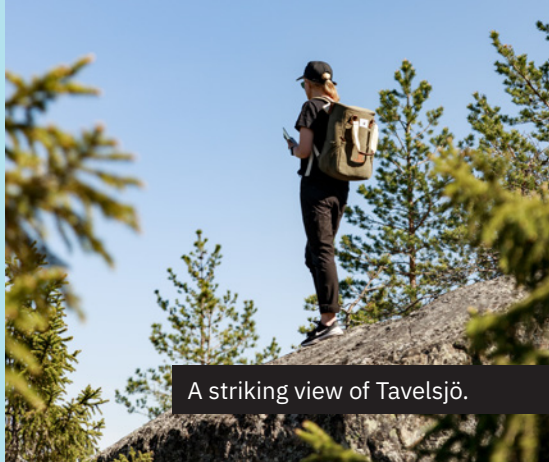
A striking view of Tavelsjö.

A visitor guide that helps you find your way up ten mountains, all located around Tavelsjö. The peaks offer different experiences, levels of difficulty and views. For each mountain there is a marked path from its base up to the top. Choose between walks from 0.5 to 2.1 km (one way) and slopes that vary between 46 and 165 meters. After climbing all the mountains you will have climbed a total of 1,000 meters.