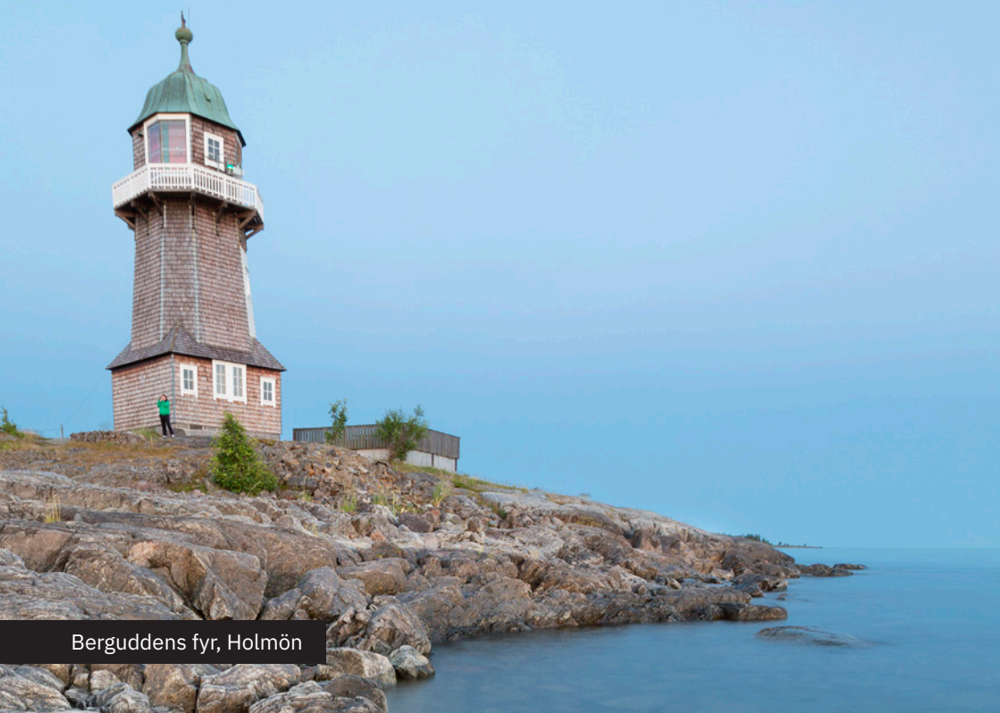
Berguddens fyr, Holmön